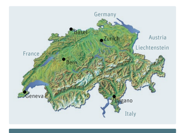
Distance from Bern to: Zurich: 50 min, Basel: 1 h, Geneva: 1 h 45 min, Milan: 3 h, Frankfurt: 4 h, Munich: 6 h, Paris: 4 h 50 min

Switzerland Tourism: myswitzerland.com Bern Tourism: bern.com